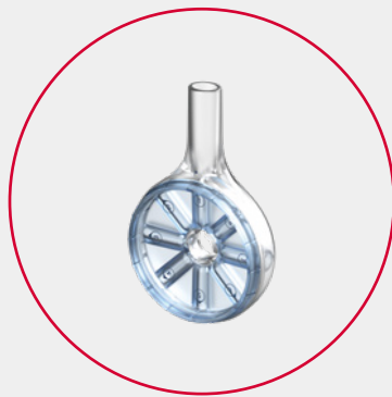
LARGE DOSE DPI